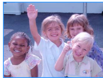
Kids at Inez Martin Early Childhood Development Center, Key West

Wesley House Family Services is accredited by the prestigious International Council on Accreditation. The agency adheres to the "Best Practice" concept of developing and implementing the most efficient and effective way of delivering its services.